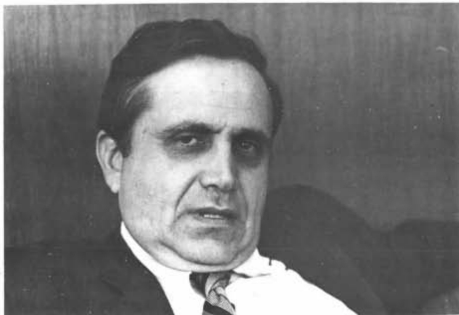
Stanley Sporkin