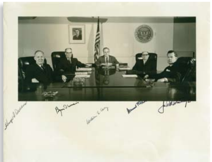
April 29, 1964 SEC Commission