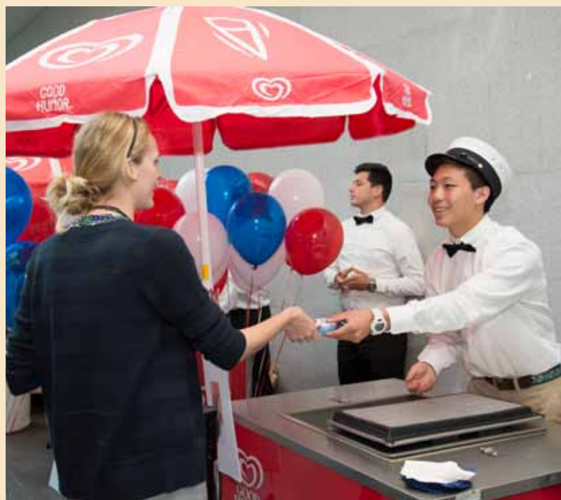
June 5, 2014 Ice cream social celebrating the U.S. Securities and Exchange Commission's 80th anniversary